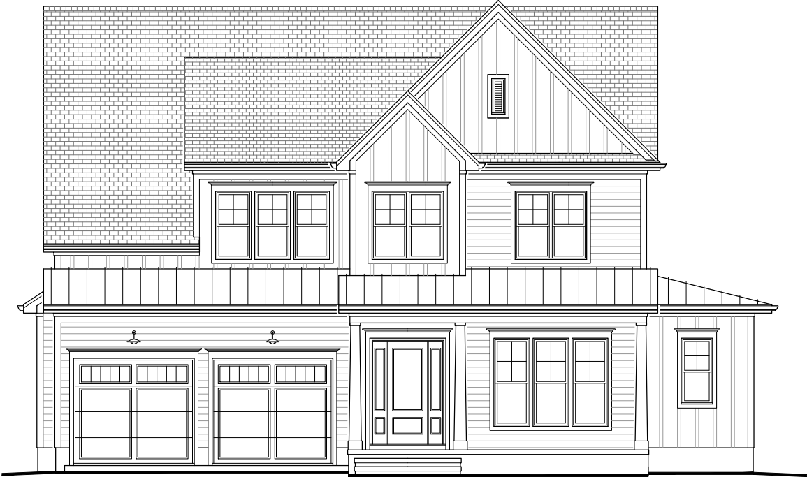
01 Front Elevation 'C' Scale: 1/8" = 1'-0"